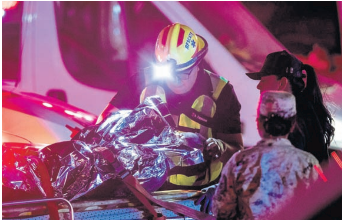
Medics give aid to a migrant who survived a fire that broke out at a Mexican immigration detention center in Juarez on Monday, March 27, 2023.

Minister Mario Búcaro said 28 of the dead were Guatemalan citizens.